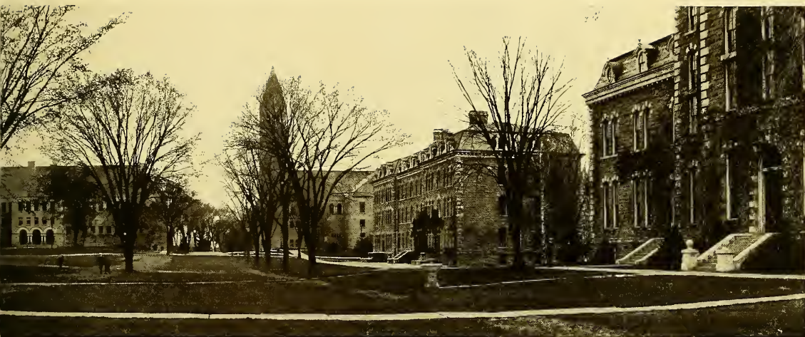
BOARDMAN HALL LOOKING SOUTH